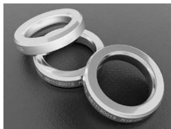
Durlon® RTJ Ring Type Joint Gaskets Styles: R, RX, BX

Durlon® Durtec® gaskets are made with a specially engineered machined metal core that is bonded on both sides with soft covering layers, typically flexible graphite. The core is produced by proprietary technology that allows the finished gasket to have the best possible mechanical support function. The Durtec® core is virtually uncrushable, unlike conventional corrugated metal core gaskets. The precision construction guarantees that Durlon® Durtec® gaskets will have excellent sealing characteristics even under low bolt loads.