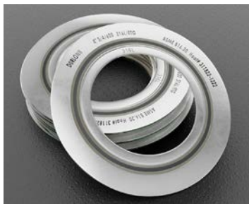
Durlon® ETG Extreme Temperature Gaskets SWG/Durtec®/Kammprofile

Durlon® Spiral Wound Gaskets are made with an alternating combination of a preformed engineered metal strip and a more compressible filler material which creates an excellent seal when compressed. The engineered shape of the metal strip acts as a spring under load, resulting in a very resilient seal under varying conditions. The strip metallurgy and filler material can be selected to seal a wide range of applications. All Class 150 & 300 Durlon® SWG styles have been engineered to precise manufacturing tolerances and utilize optimal winding density that allow for lower stress (bolt load) sealing compared to conventional spiral wound gaskets thus eliminating the need to stock both standard and low stress SWG's.