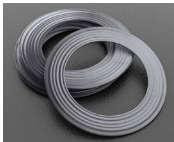
Durlon® Durtec® Specially Engineered Metal Core Technology

The serrated core is covered with soft sealing material and is dependent on the service conditions of the system (flexible graphite and expanded PTFE are most common).