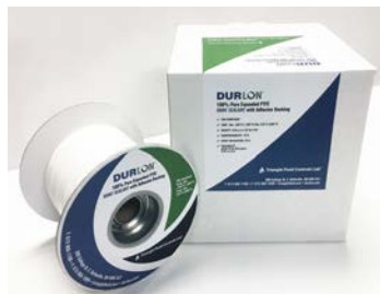
Durlon® Joint Sealant 100% Pure Expanded PTFE Gasket Material

Durlon® Extreme Temperature Gaskets (ETG) have been engineered to provide the preeminent solution to sealing gasketed joints having exposure to high temperatures, typically greater than 650°C (1,200°F) and up to 1,000°C (1,832°F). At extreme temperatures, flange assembly torque retention is the key component to maintaining a tight seal. Durlon® ETG combines an oxidation boundary material with the excellent stability and sealing characteristics of flexible graphite in order to preserve seal integrity and retain the initial assembly torque.