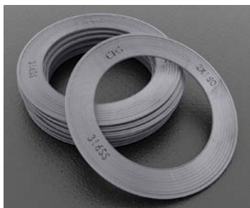
Durlon® CFG Corrugated Flexible Graphite Gasket

The Durlon brand represents global leadership in sealing solutions with proven reliability, innovative processes and sustainable integrity in a wide range of demanding applications.